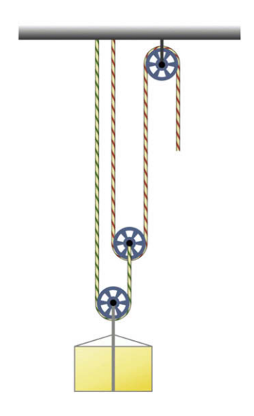
Fig. 1. Explanatory text and static-frame presentation.

A sole open question measured comprehension of the complete functional mental model ("runnable" model) of the three-pulley system. It required integration of the components and local kinematics of the three-pulley system. The question was: "Describe as precisely as possible what happens to all of the system's elements when a person pulls the top rope." A scoring criteria grid with 10 possible correct answers was used to rate the answers of each participant: every correct movement (presence of movement, direction, relative speed) of each component (pulleys, ropes, ceiling, and load) was credited with one point; for example the answer "When a person pulls the top rope the rope moves over the upper pulley" or "The middle pulley turns over and counter-clockwise" was credited with one point. The maximum score was 10 points. A half point penalty was taken away from the total score for each incorrect answer. Then, each participant's score was transformed into a percentage. Participants' answers were evaluated by two independent raters with an interrater agreement of 94%.